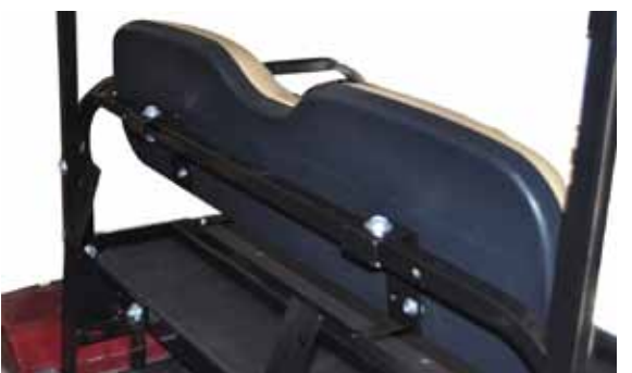
13. Attach seat back cushion to horizontal bar bracket using hardware from pack #2.