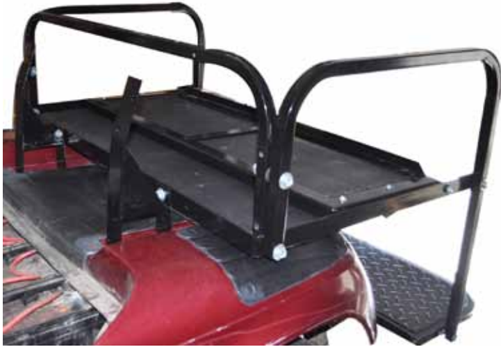
10. Attach Horizontal Support Bracket and Armrests using hardware from packs #3 and #7. You will need the remaining hardware in pack #3 in the next step. Do not tighten hardware.