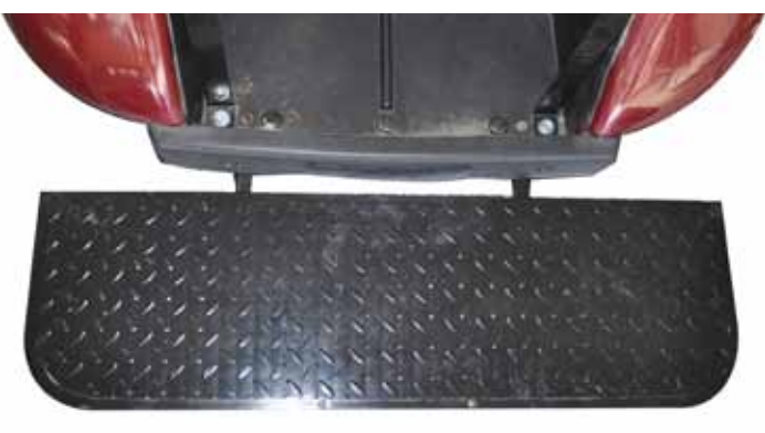
8. Attach footrest with hardware in pack #5 in 3places where bag well rivets were removed.